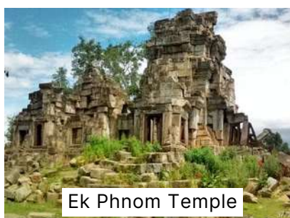
Ek Phnom Temple