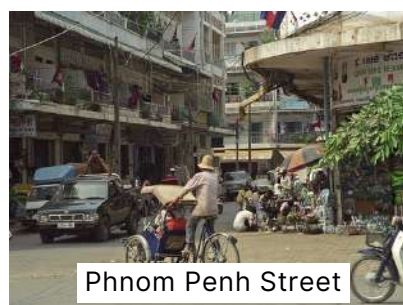
Phnom Penh Street